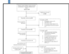
Figure 1. PRISMA diagram.

The search strategy produced eight relevant articles, with nine intervention arms, which met the inclusion criteria (Figure 1). All trials were from peer-reviewed journals, seven were experimental studies and one reported on follow up data. 24 Only Fukuda et al 24 were contacted by the authors in regards to absent post-intervention data for their study. They advised that post-intervention data were not collected as they had reported on this in a previous publication on a different group of subjects. 25 The reviewers chose to include this study, despite it not technically being an experimental trial, as they felt the follow-up data would provide useful information. No experimental protocols were identified that had not progressed to published trials.